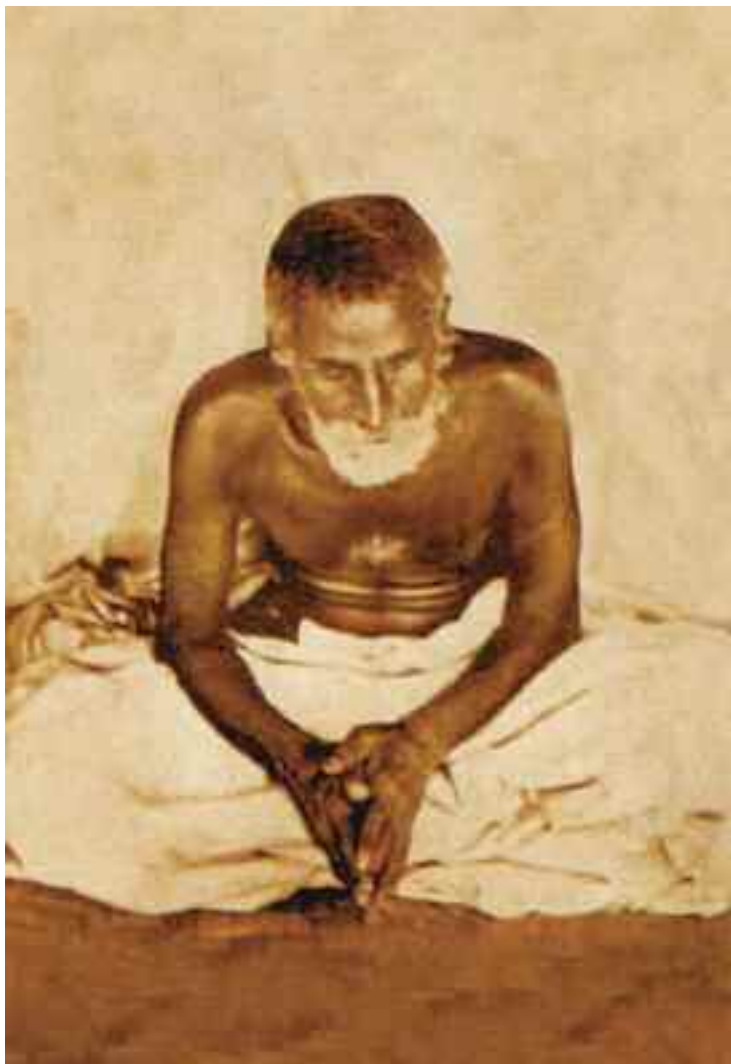
oṃ viṣṇupāda paramahaṃsa Śrī Śrīmad Gaurakīśora dāsa Bābājī Mahārāja