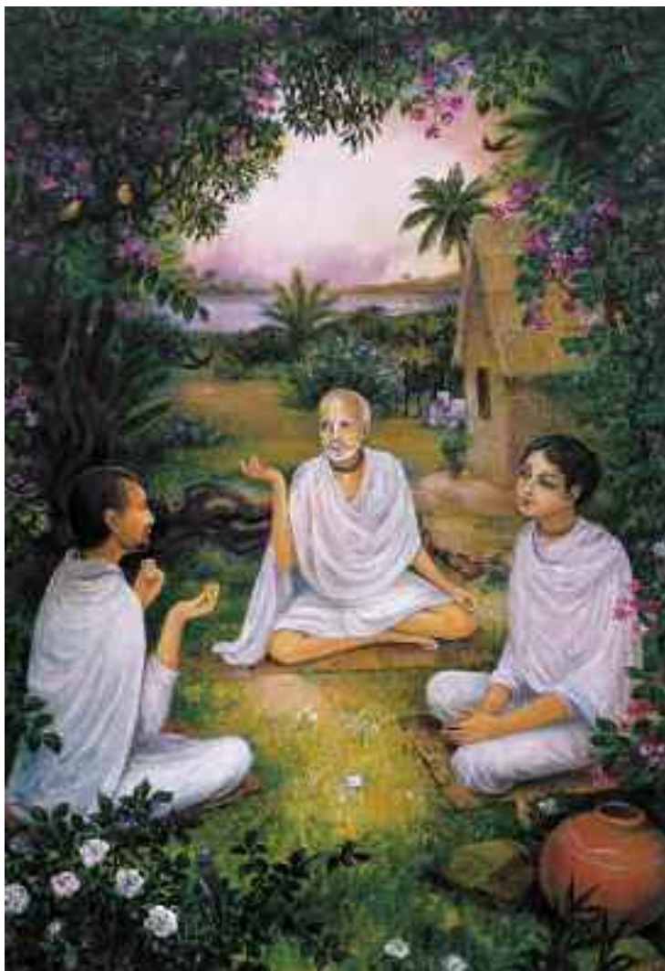
Śrīla Raghunatha dāsa Bābājī explains Daśa-mūla to Vrajanātha and Vijaya Kumāra in Navadvīpa.