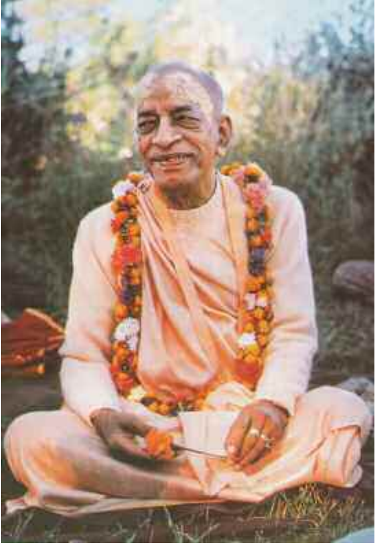
om viṣṇupāda aṣṭottara-śata Śrī Śrīmad Bhaktivedānta Svāmī Mahārāja