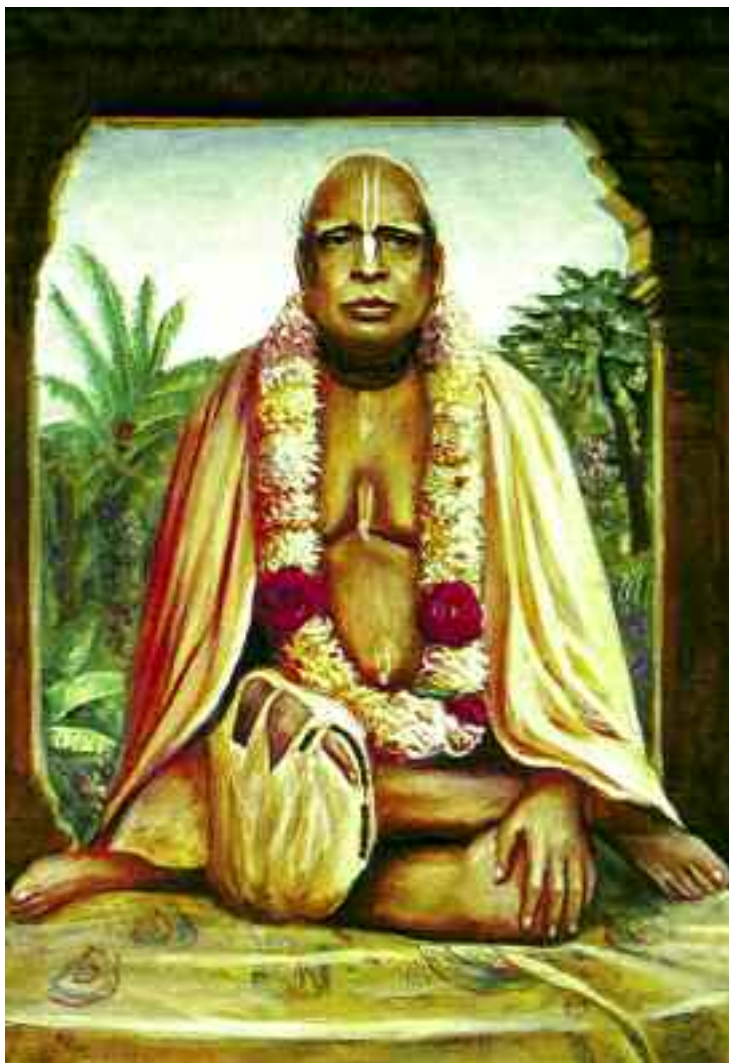
oṃ viṣṇupāda Saccidānanda Śrī Śrīmad Bhaktivinoda Ṭhākura